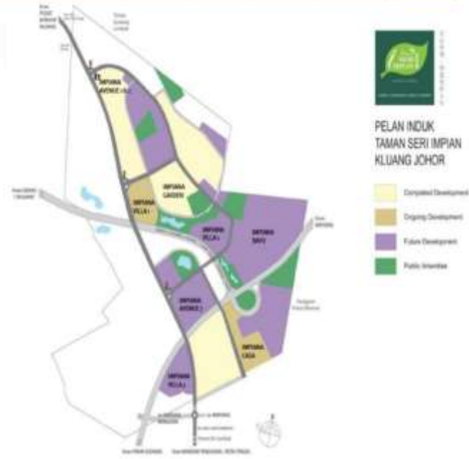
Figure 3: Taman Sri Impian