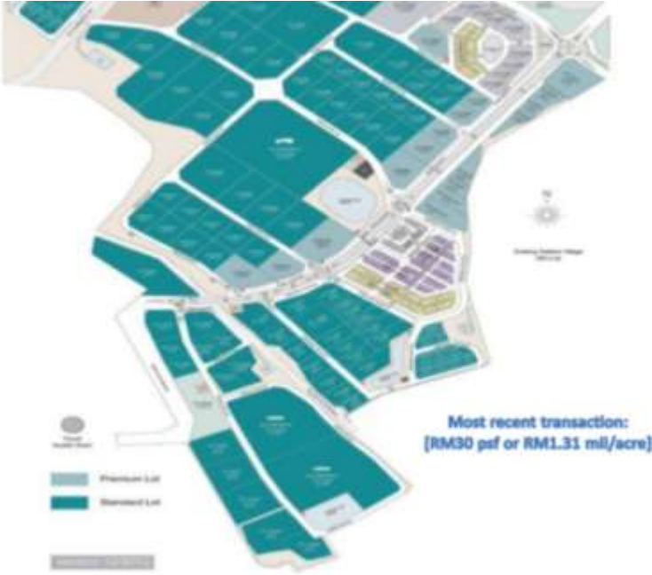
Figure 2: The Sendayan Techvalley