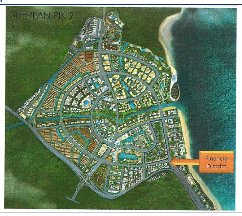
Figure #2 PIK 2 overview