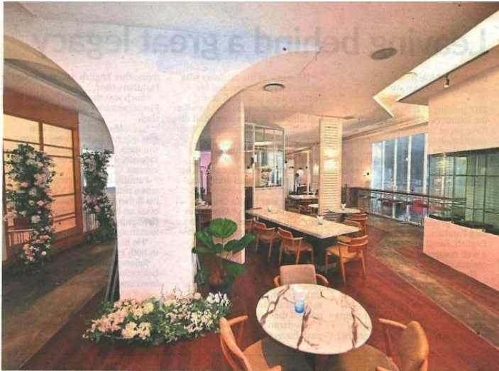
Brew & Co features a contemporary setting that includes a coffee bar, sofa lounge and pastry showcase kitchen.