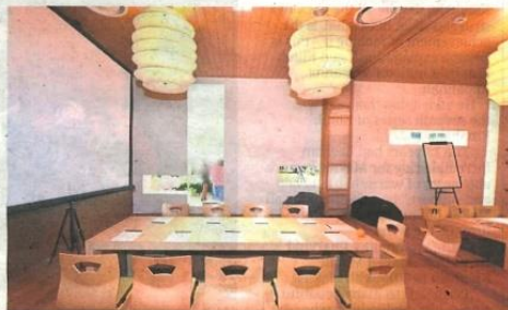
One of two co-working spaces available for rent by day or month at Brew & Co in d'Tempat Country Club.

Besides the co-working spaces that can be rented by day or month, a highlight of Brew & Co is its array of